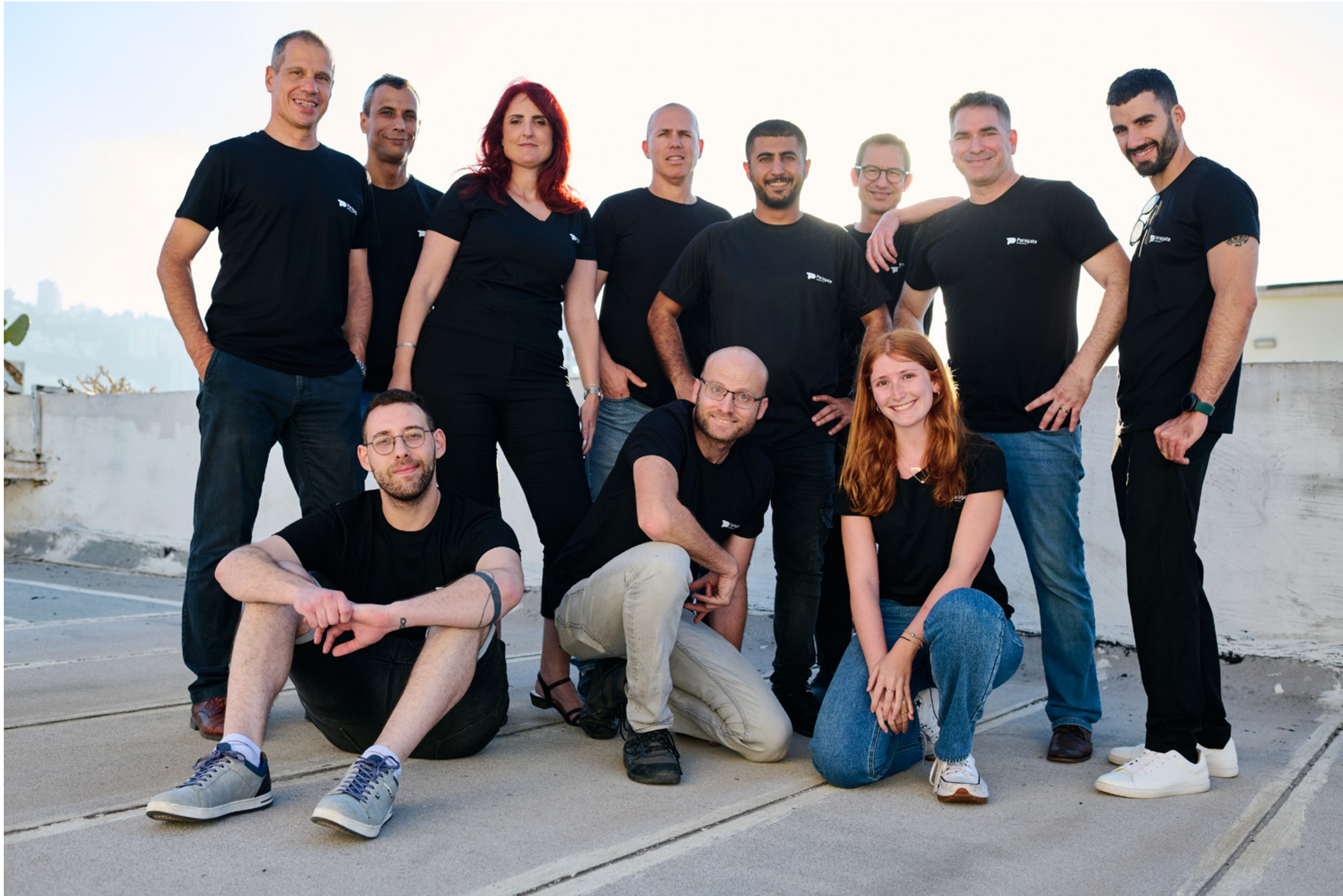
Paragate Medical team. For Paragate