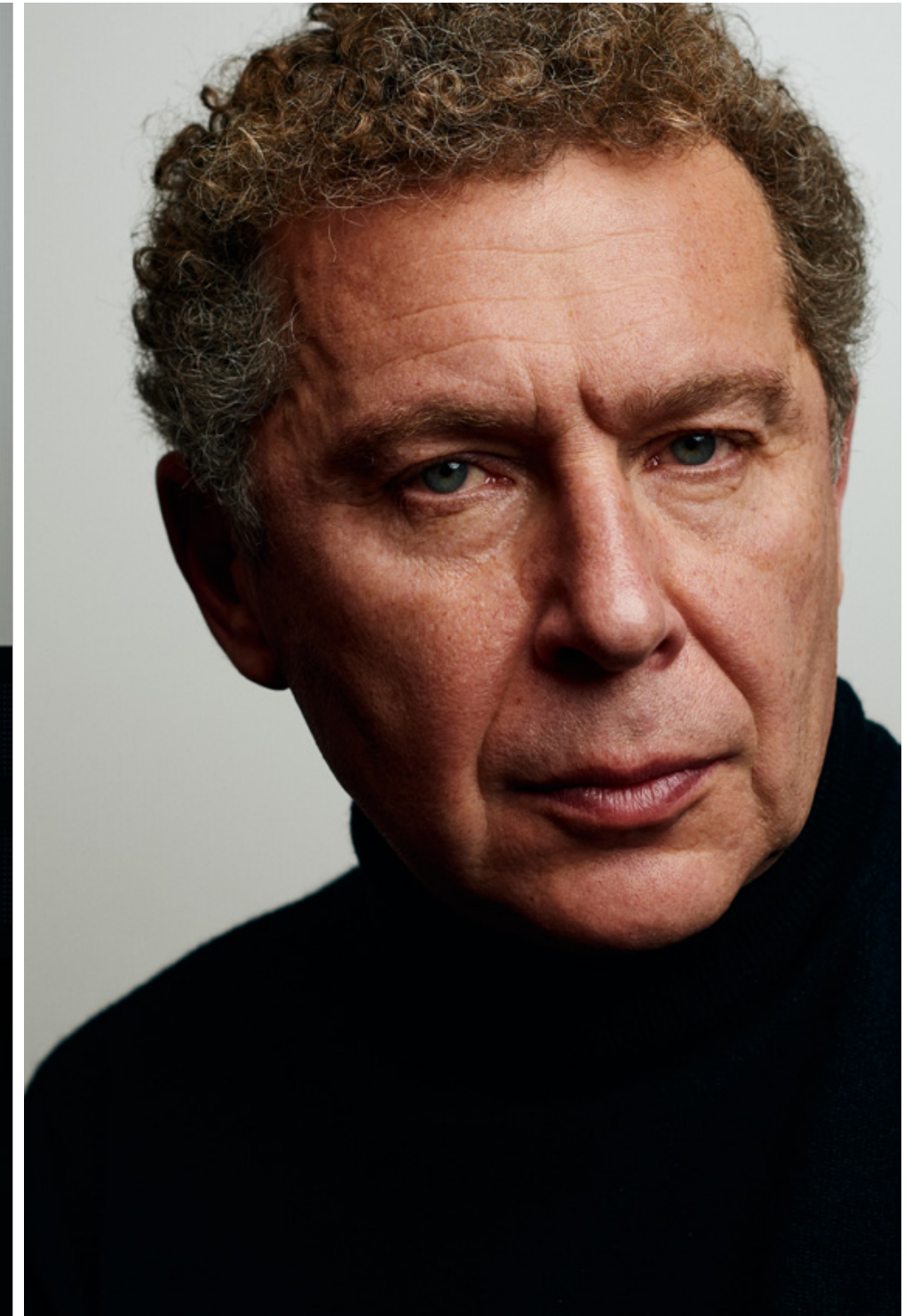
Alexander Mamut, billionaire businessman, lawyer, banker and investor. For Forbes