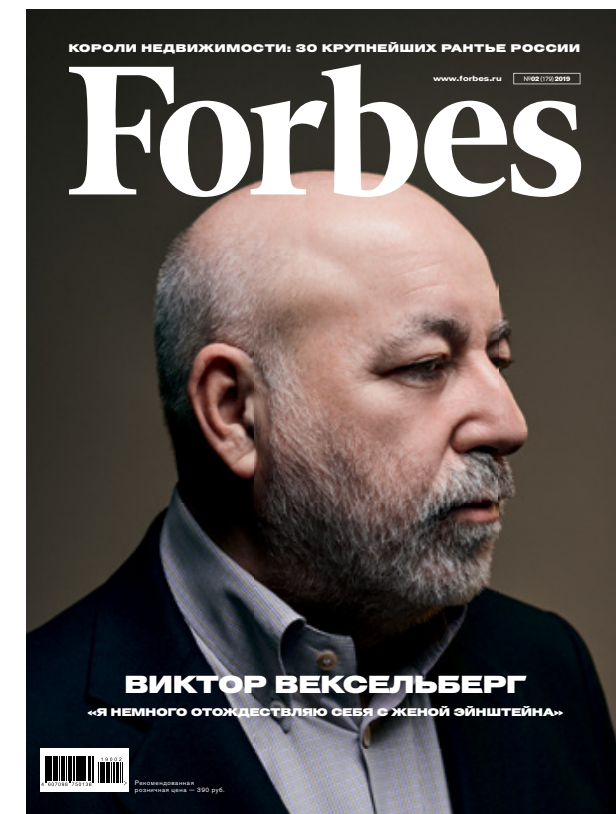
Viktor Vekselberg, billionaire businessman, the owner and President of Renova Group.