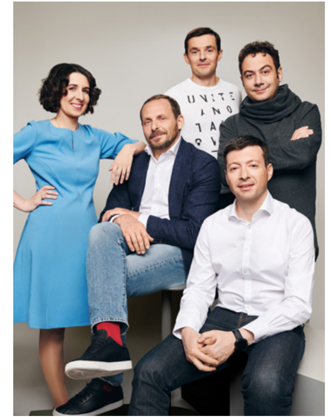
Arkady Volozh, technology entrepreneur, founder of Yandex, and company's board members.