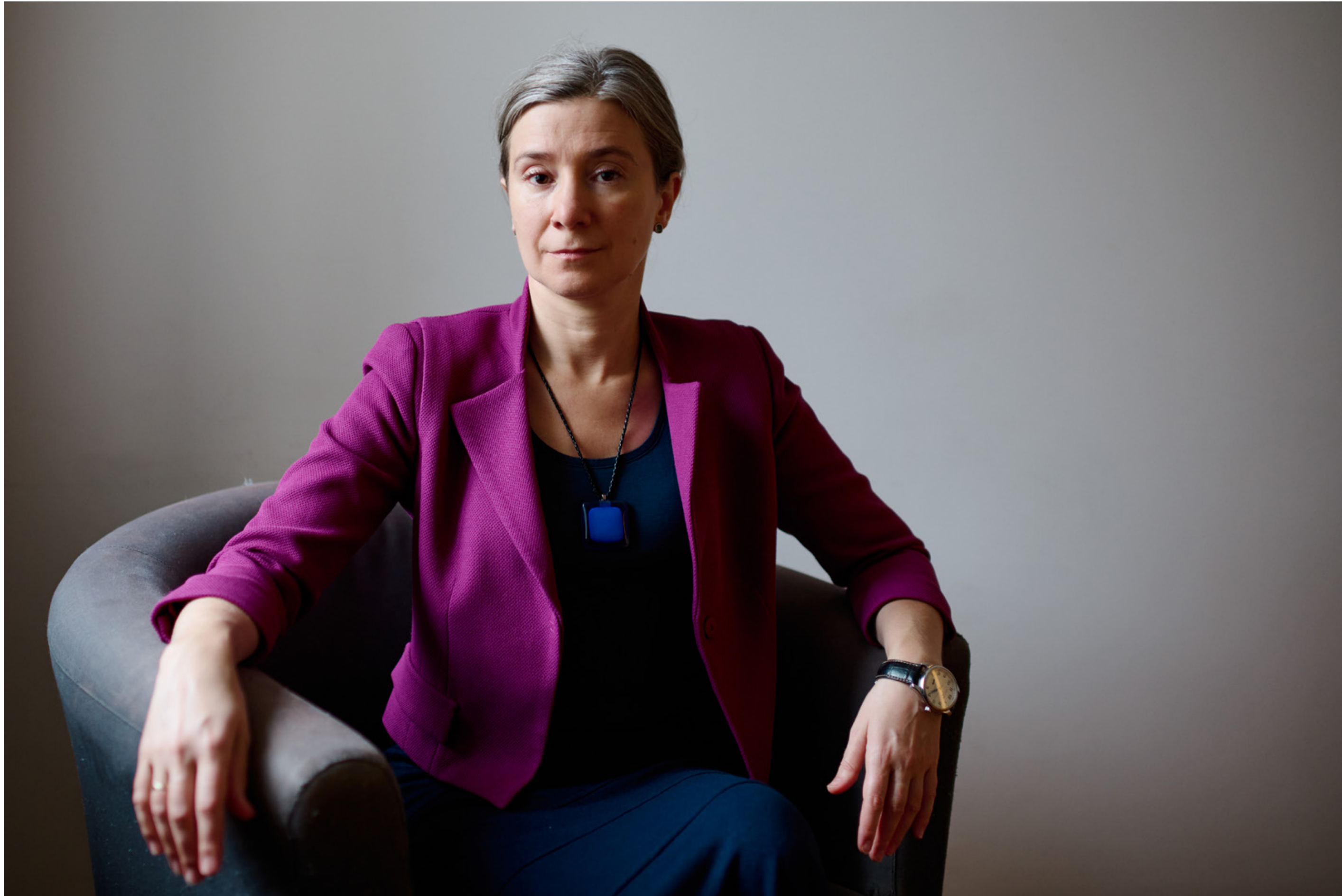
Ekaterina Schulmann, political scientist