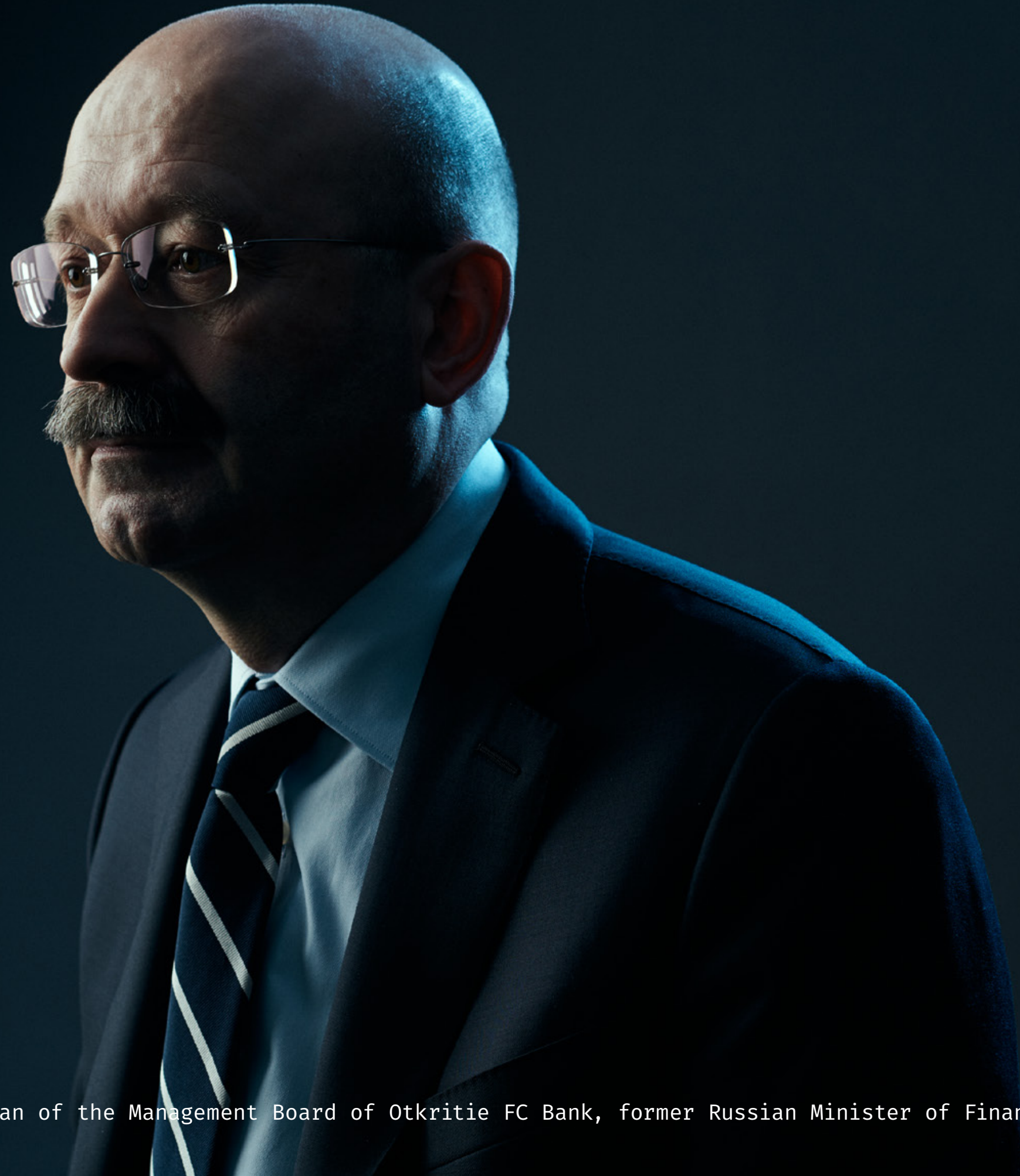
Mikhail Zadornov, economist, Chairman of the Management Board of Otkritie FC Bank, former Russian Minister of Finance.