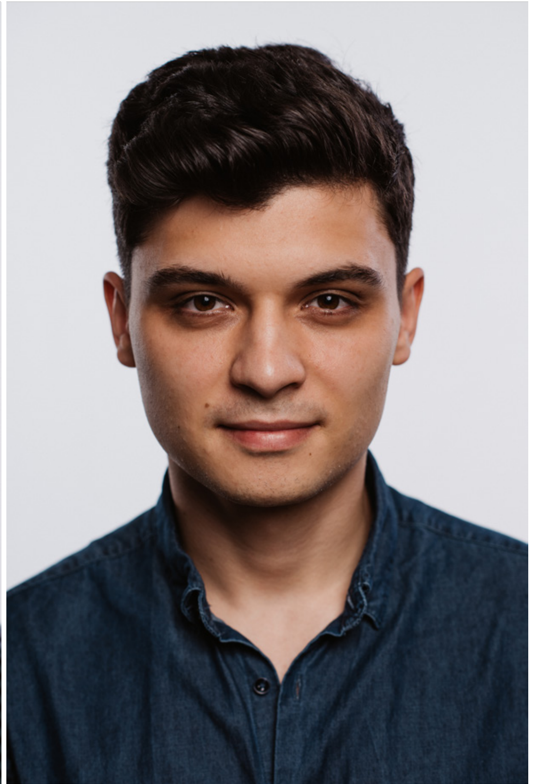
British American Tobacco employees. For British American Tobacco