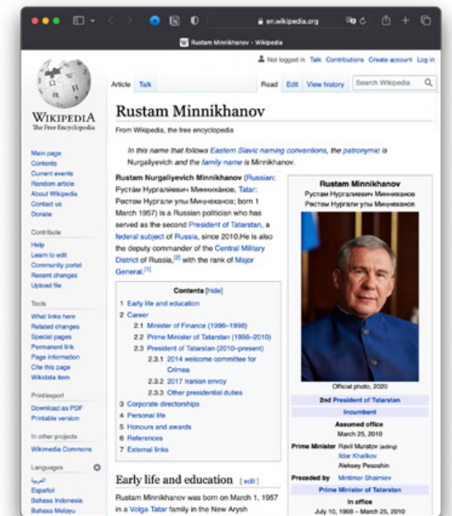
Rustam Minnikhanov, the 2nd President of Tatarstan Republic, Russia.