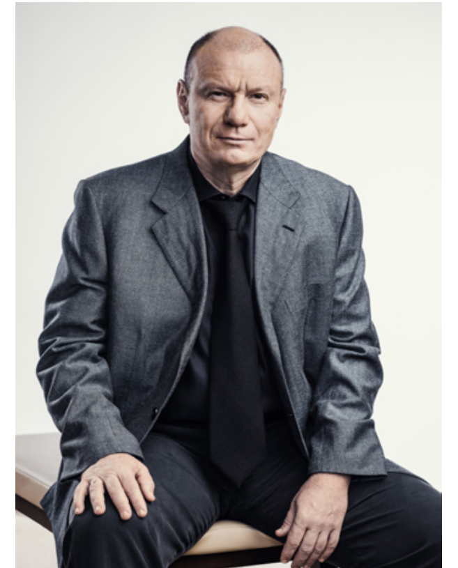
Vladimir Potanin, russian billionaire businessman, chairman of Interros.