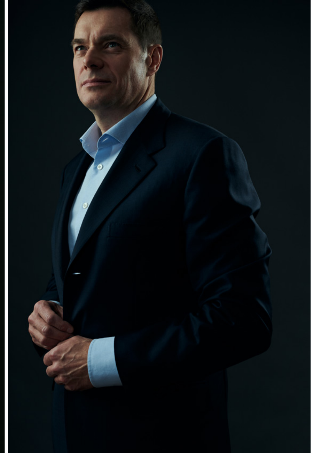
Alexey Mordashov, billionaire businessman, the main shareholder and Chairman of Severstal. For Forbes