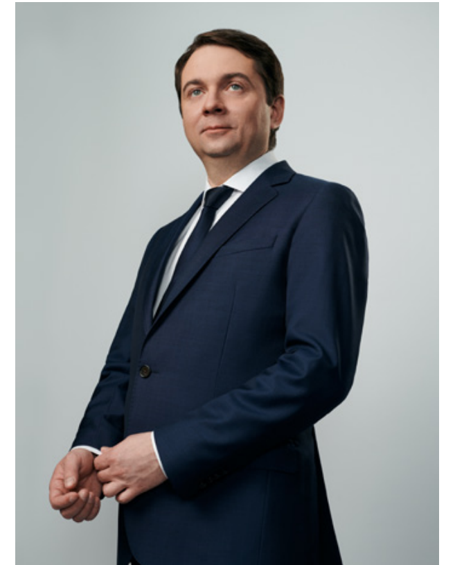
Andrey Chibis, the 5th Governor of Murmansk Oblast, Russia. For the Government of Murmansk Oblast