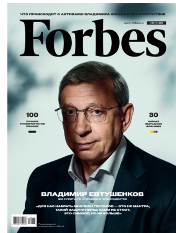
Vladimir Yevtushenkov, billionaire businessman, the majority owner and former chairman of AFK Sistema PAO.