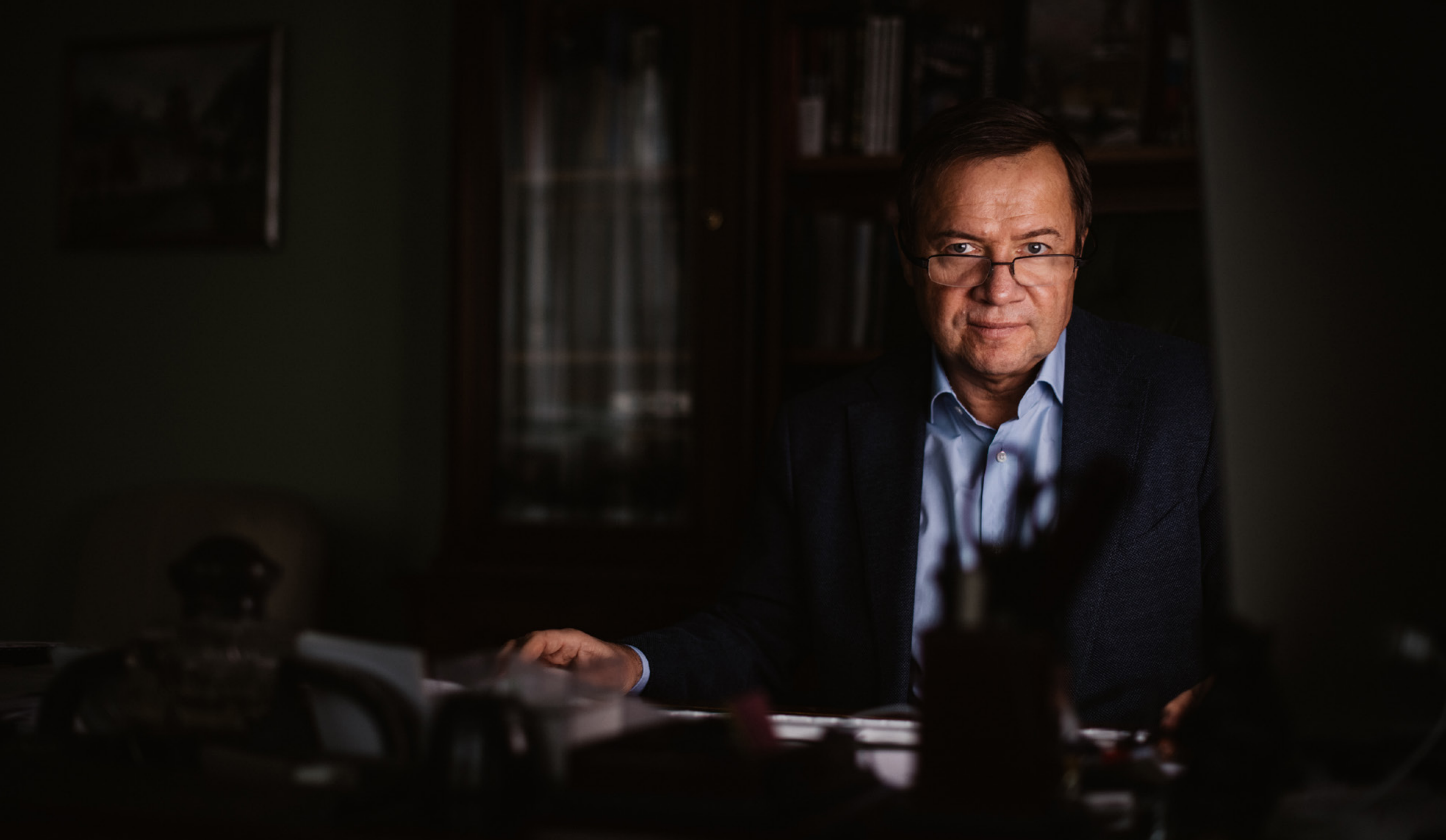
Valentin Yumashev, journalist, politician and businessman, advisor of Russian President