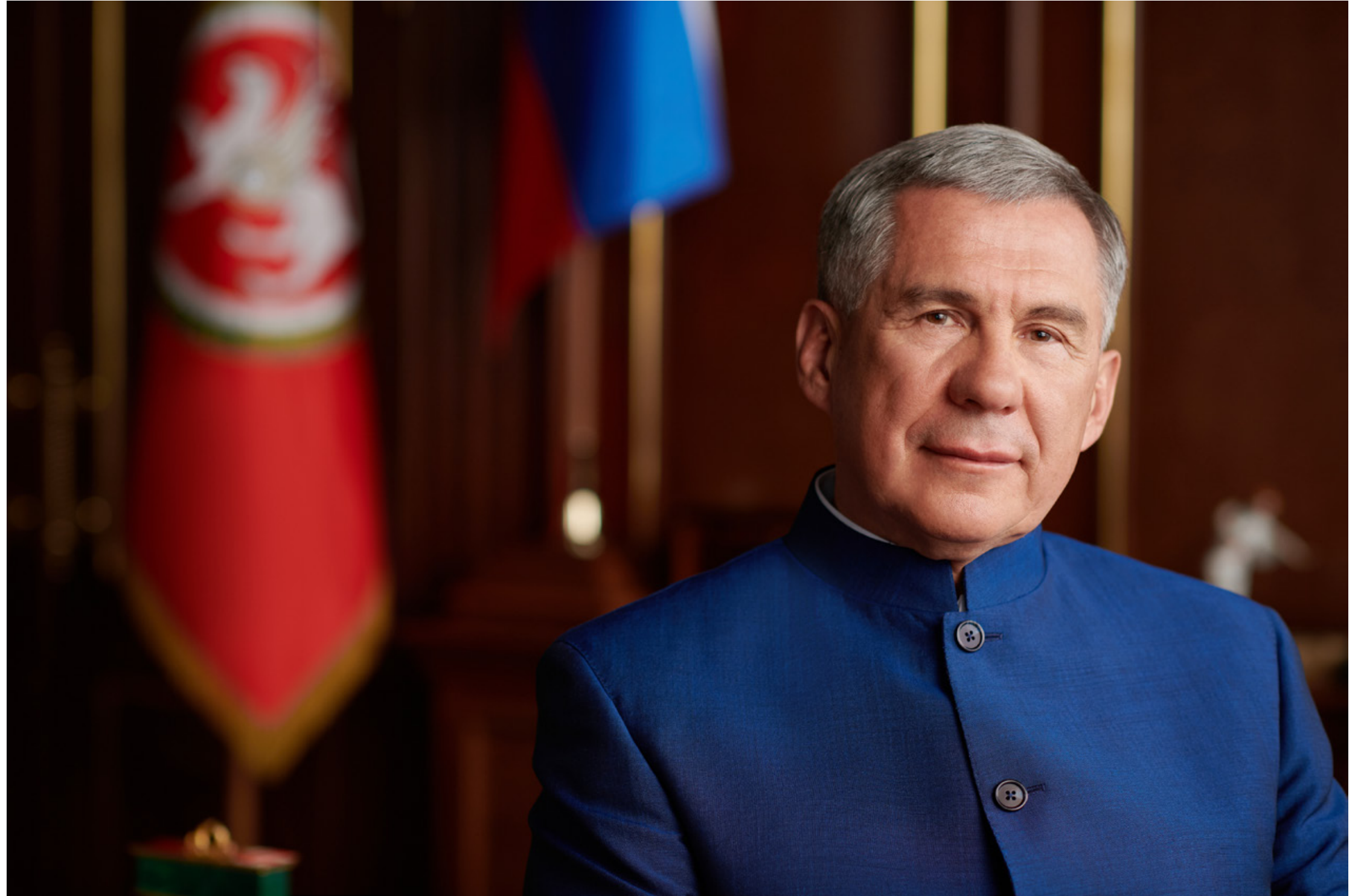
Rustam Minnikhanov, the 2nd President of Tatarstan Republic, Russia. For the Government of Tatarstan