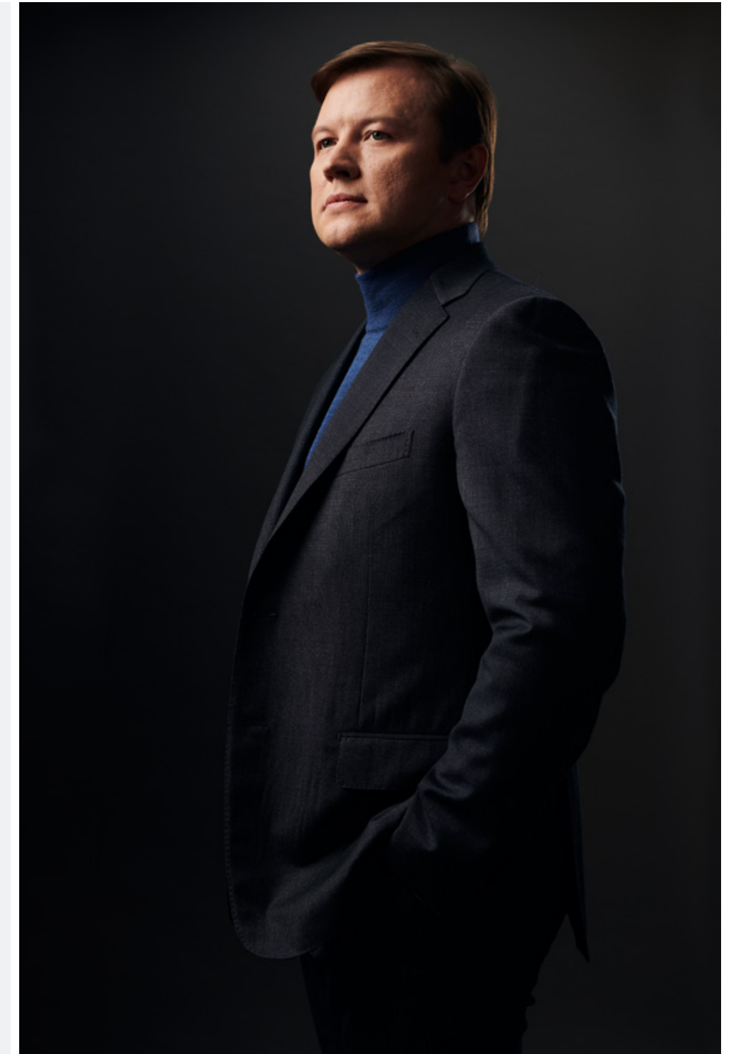
Vladimir Efimov, Deputy Mayor of Moscow for Economic Policy and Property and Land Relations. For the Government of Moscow